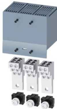
distribution wire connector 6 cables 3 units accessory for: 3VA6 150/250