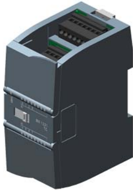
SIMATIC S7-1200, Analog input, SM 1231 TC, 8 AI thermocouples