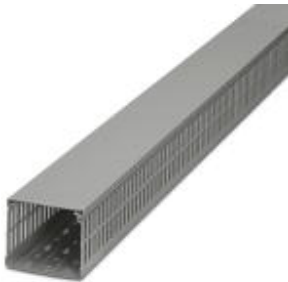
Cable duct, gray, consisting of upper and lower part, width: 80 mm, height: 100 mm, length 2000 mm

Please be informed that the data shown in this PDF Document is generated from our Online Catalog. Please find the complete data in the user's documentation. Our General Terms of Use for Downloads are valid ( http://download.phoenixcontact.com )