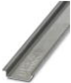
DIN rail, material: Aluminum, unperforated, height 7.5 mm, width 35 mm, length: 2 m

DIN rail - NS 35/ 7,5 AL UNPERF 2000MM - 0801704