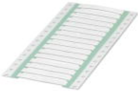
The illustration shows WMS 6,4 (30X10)R

Shrink sleeve, Roll, white, Unlabeled, Can be labeled with: Thermomark R, Thermomark X, Perforated, Mounting type: Slide on, Cable diameter: 1.6-4.8 mm, Lettering field: 30 x 9 mm