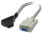
Data cable for communication between devices with a D-SUB 9 RS-232 connection and Phoenix Contact devices with the 12-pos. IFS data port such as QUINT UPS-IQ or TRIO UPS.

Data cable - IFS-RS232-DATACABLE - 2320490