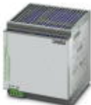
Maintenance-free power storage device based on dual layer capacitor

Power storage devices - UPS-CAP/24DC/10A/10KJ - 2320377