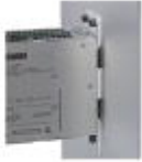
Universal wall adapter

Assembly adapters - UWA 182/52 - 2938235