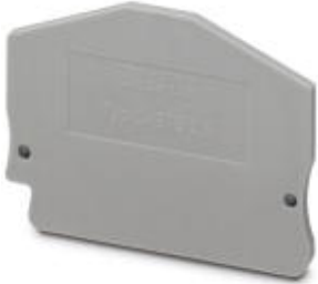
End cover, Length: 51 mm, Width: 2.2 mm, Height: 43 mm, Color: gray

Please be informed that the data shown in this PDF Document is generated from our Online Catalog. Please find the complete data in the user's documentation. Our General Terms of Use for Downloads are valid ( http://download.phoenixcontact.com )