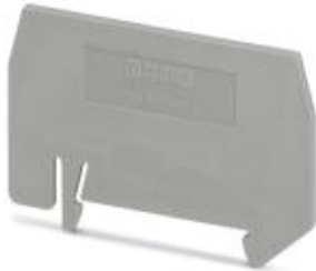
Partition plate, Length: 61 mm, Width: 2 mm, Height: 42 mm, Color: gray

Please be informed that the data shown in this PDF Document is generated from our Online Catalog. Please find the complete data in the user's documentation. Our General Terms of Use for Downloads are valid ( http://download.phoenixcontact.com )