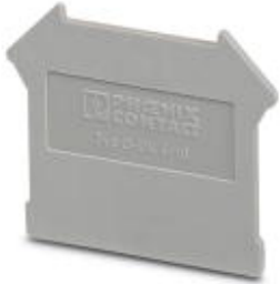
End cover, Length: 42.5 mm, Width: 1.8 mm, Height: 35.9 mm, Color: gray

Please be informed that the data shown in this PDF Document is generated from our Online Catalog. Please find the complete data in the user's documentation. Our General Terms of Use for Downloads are valid ( http://download.phoenixcontact.com )