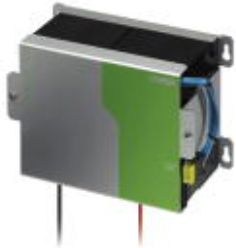
Power storage device, lead AGM, VRLA technology, 24 V DC, 12 Ah. Connection via pin cable lug, 14 mm.

Please be informed that the data shown in this PDF Document is generated from our Online Catalog. Please find the complete data in the user's documentation. Our General Terms of Use for Downloads are valid ( http://download.phoenixcontact.com )