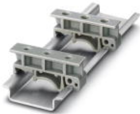
Rail adapters, Width: 10 mm, Height: 19 mm, Length: 42.6 mm, Color: gray

Please be informed that the data shown in this PDF Document is generated from our Online Catalog. Please find the complete data in the user's documentation. Our General Terms of Use for Downloads are valid ( http://download.phoenixcontact.com )