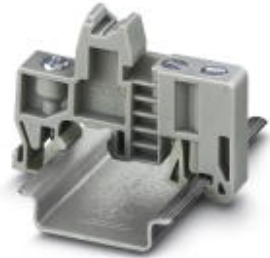
End clamp, for assembly on NS 32 or NS 35/7.5 DIN rail

Please be informed that the data shown in this PDF Document is generated from our Online Catalog. Please find the complete data in the user's documentation. Our General Terms of Use for Downloads are valid ( http://download.phoenixcontact.com )