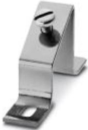
Angled brackets with M6 screw, for fixing DIN rails at an angle of 30°, height: 46 mm

Please be informed that the data shown in this PDF Document is generated from our Online Catalog. Please find the complete data in the user's documentation. Our General Terms of Use for Downloads are valid ( http://download.phoenixcontact.com )