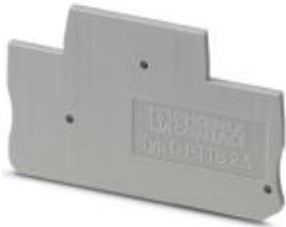
End cover, Length: 68 mm, Width: 2.2 mm, Color: gray

Please be informed that the data shown in this PDF Document is generated from our Online Catalog. Please find the complete data in the user's documentation. Our General Terms of Use for Downloads are valid ( http://download.phoenixcontact.com )