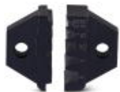
Spare die for CRIMPFOX 6

Replacement die - CRIMPFOX 6/DIE - 1212035