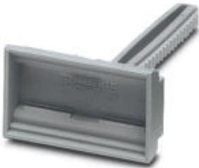
Terminal strip marker carrier, gray, Unlabeled, Mounting type: Plug in, Lettering field: 20 mm x 8 mm

Please be informed that the data shown in this PDF Document is generated from our Online Catalog. Please find the complete data in the user's documentation. Our General Terms of Use for Downloads are valid ( http://download.phoenixcontact.com )