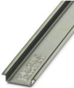
DIN rail, material: Steel, unperforated, height 7.5 mm, width 35 mm, length: 2 m

Please be informed that the data shown in this PDF Document is generated from our Online Catalog. Please find the complete data in the user's documentation. Our General Terms of Use for Downloads are valid ( http://download.phoenixcontact.com )