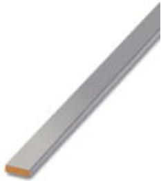
PEN conductor busbar, 3mm x 10 mm, length: 1000 mm

Please be informed that the data shown in this PDF Document is generated from our Online Catalog. Please find the complete data in the user's documentation. Our General Terms of Use for Downloads are valid ( http://download.phoenixcontact.com )