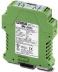
Digital extension module with 8 digital inputs

Please be informed that the data shown in this PDF Document is generated from our Online Catalog. Please find the complete data in the user's documentation. Our General Terms of Use for Downloads are valid ( http://download.phoenixcontact.com )